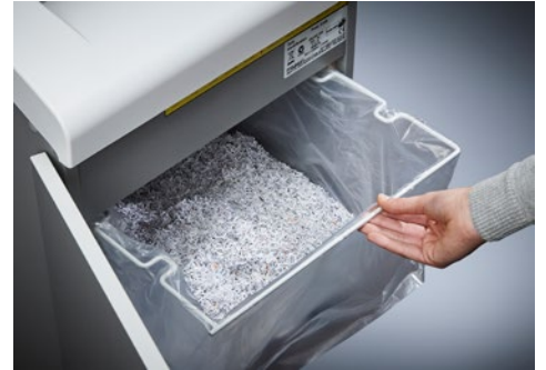
Dahle Security 510 document shredder