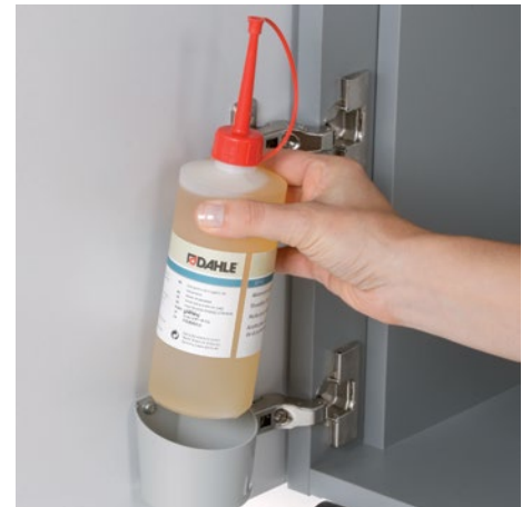
Environmentally friendly oil is always easy to access, included with all cross-cut models