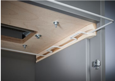
Dahle Security 510 document shredder