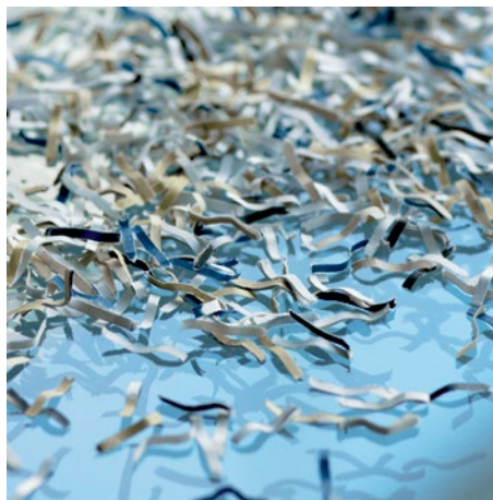
P-5 security: recommended, for example, for data media containing secret data