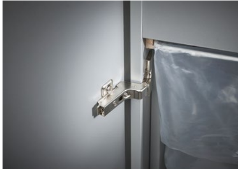
Dahle Security 510 document shredder