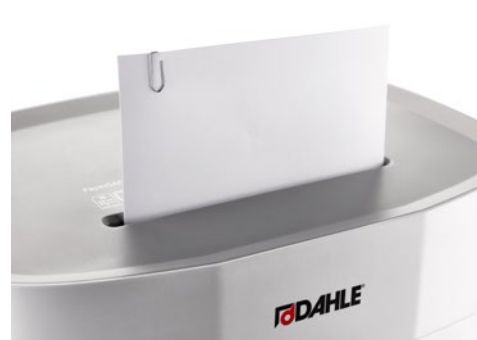
DAHLE PaperSAFE® document shredder 240 DAHLE PaperSAFE® document shredder 240 DAHLE PaperSAFE® document shredder 240