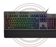
Legion K500 Gaming Keyboard