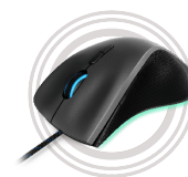
Lenovo Legion M500 RGB Gaming Mouse