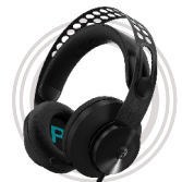
Lenovo Legion H300 Gaming Headset