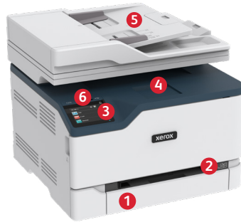
Xerox® C235 Color Multifunction Printer