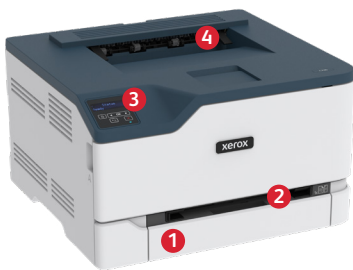
Xerox® C230 Color Printer