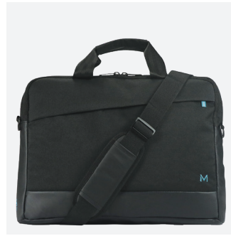
Adjustable and removable