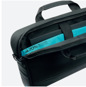
With reinforced laptop compartment