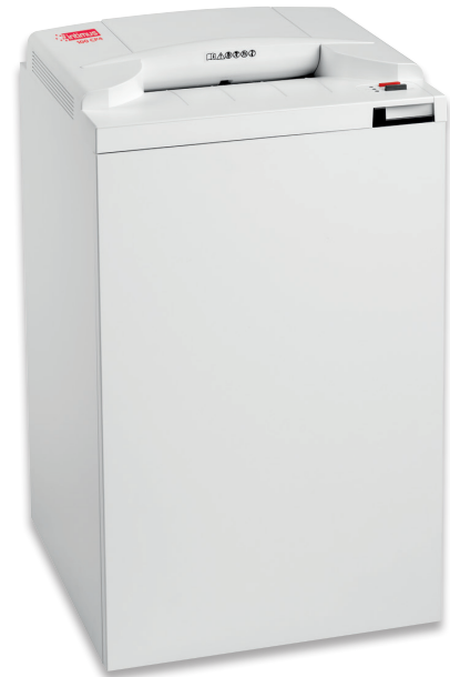
W/D/H 49 x 44 x 90 cm