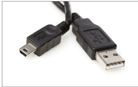
Safescan USB update cable Art. no: 112-0459