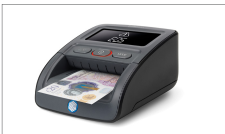
Checks and verifies banknotes on up to seven security features