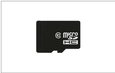
Safescan MicroSD Card Art. no: Various (based on device and currencies)