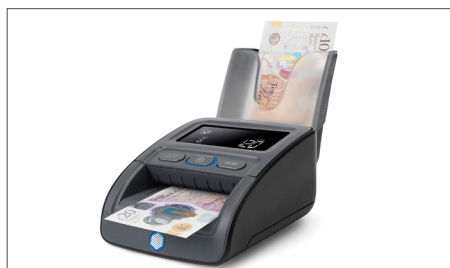
Collects and stores stacks of banknotes with the included Safescan RS-100 banknote stacker