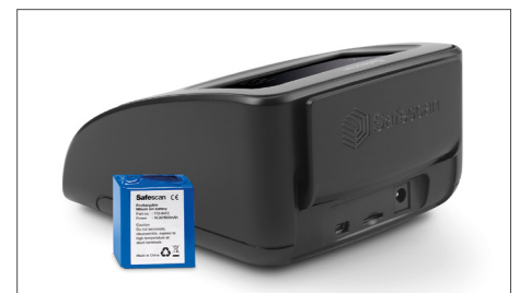
Supports up to 30 hours of portable use with the included Safescan LB-105 battery